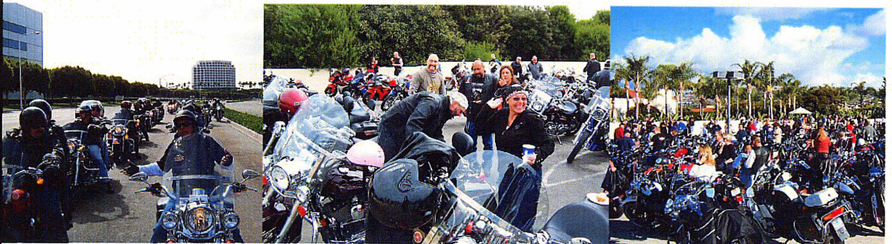
highlights from previous rides

www.ocgunsandhoses.com or call Shiree Colton at 714.285.2805